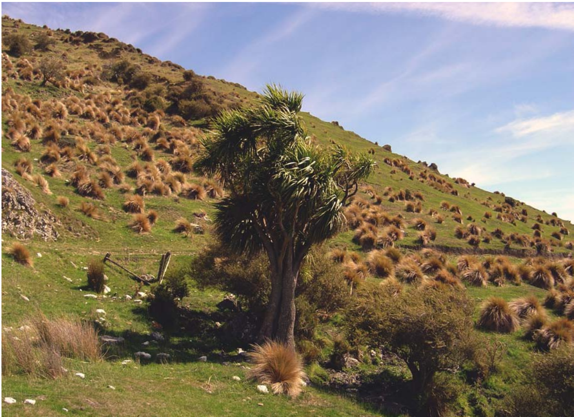
They are presently tidying up the spring systems on the farm.

result of prolonged drought, but generally they are well supplied with water. They are presently tidying up the spring systems on the farm. Stock numbers are varied to match with water availability as outlined below.